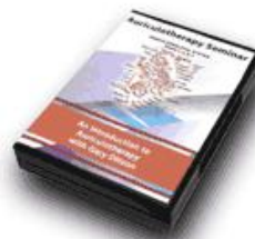
6 Disc Set